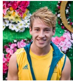
Diver & Olympic Gold Medalist ^